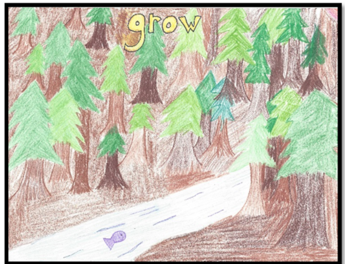
Grow by Ruby Beye Mountain Elementary, Grade 6